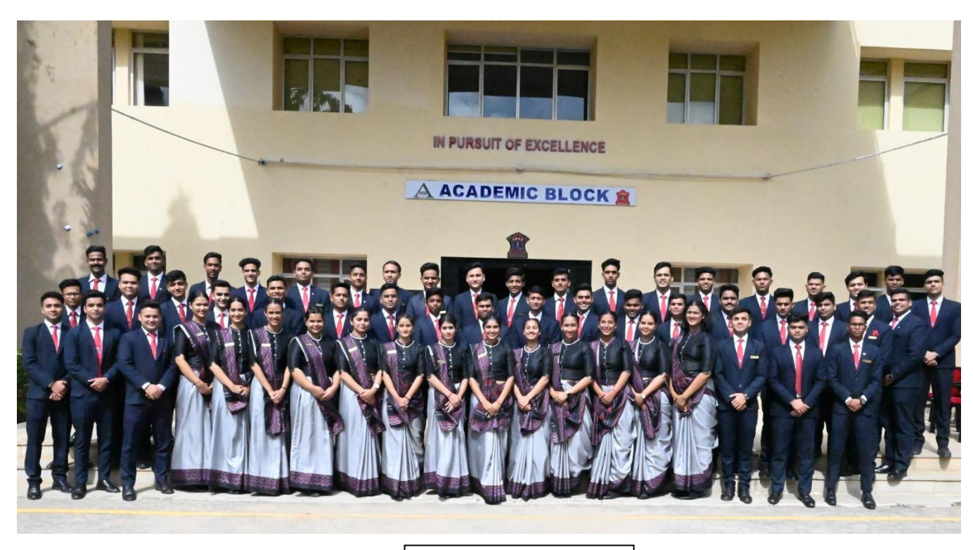
25^{th} course - 2020-21