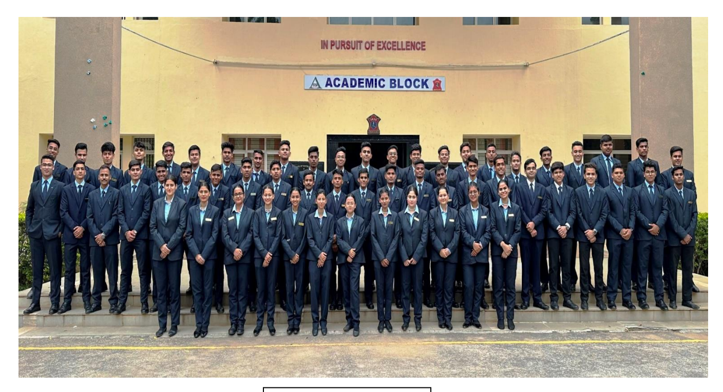
27<sup>th</sup> course – 2022-23