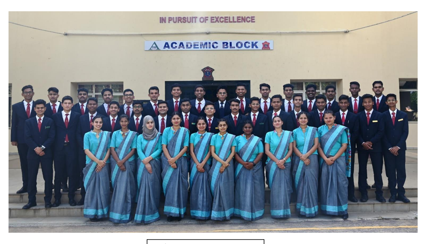
26<sup>th</sup> Course · 2021-22