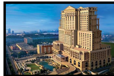
ITC Royal, Kolkata 3 students