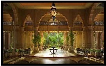
Leela Palace, Bangalore 21 students