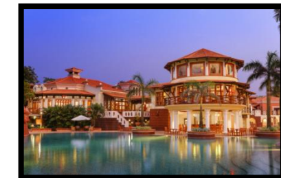
ITC Grand Resort, Goa 3 students