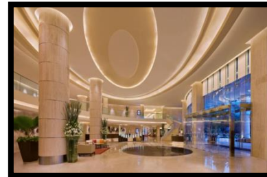
Courtyard by Marriott, Mumbai, 2 students