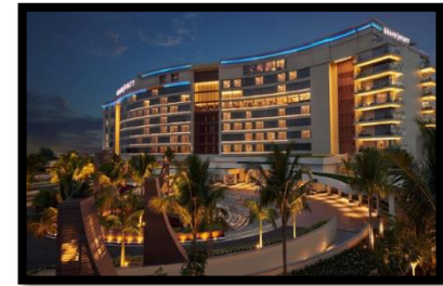
Grand Hyatt, Kochi 2 students