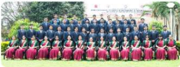
FINAL YEAR STUDENTS 2021-22

Online Admission Test (OAT) 29 May 2022 (Forenoon)